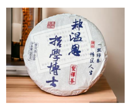
10. Laoman'e village ancient tea cake package