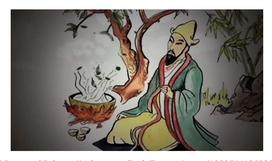
Figure 1 An Art Photograph of King Shennong's First Discovery of Tea Sitting Under the Tea Bush

Note. Accessed January 27, https://twitter.com/LadyTeapots/status/1382711125339426818