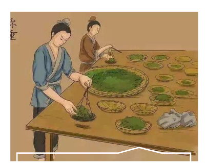
6. Measurementing for different packaging zise