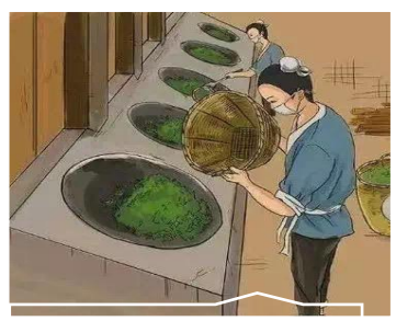
3. Firying on fire by pan for 35 minutes