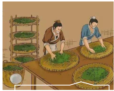
4. Rolling the fried leaves for 5-10 minutes