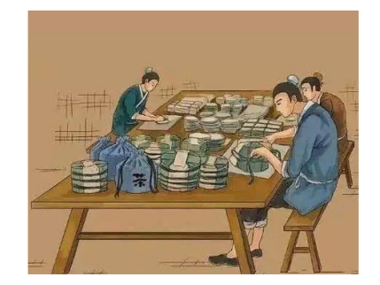
9. Packaging tea bag