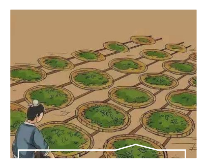
5. Drying in sun light