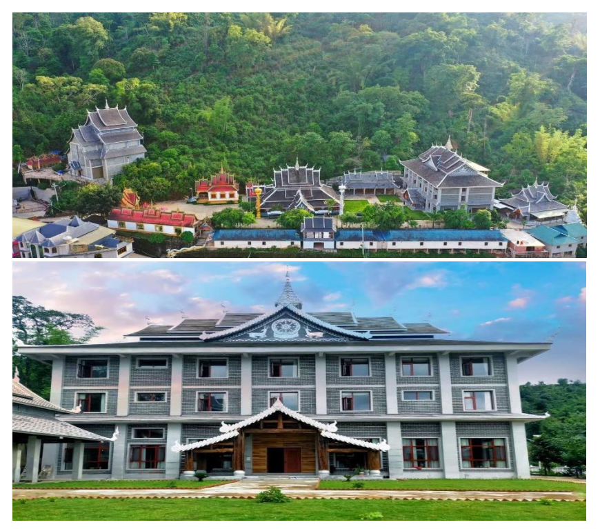
Figure 5 A Landscape Photograph of Laoman'e Village Temple on December 18, 2023

This is how a participant described his personal experiences and understanding of the hardships people faced prior to the price increases of ancient and king teas in the tea beverage market. Additionally, many research participants related similar accounts of their experiences; some even surmised that they might remain in the same impoverished state, which is uncertain for their means of subsistence, if they did not have access to ancient and king tea. Therefore, on February 8, 2024, a research participant from Laoman'e village described his experiences with low family income and the treatment they received from other majority ethnic groups due to their poor financial status, as follows: