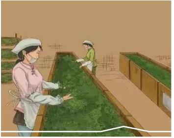
2. witthering to evoporate water about 3-5 hours