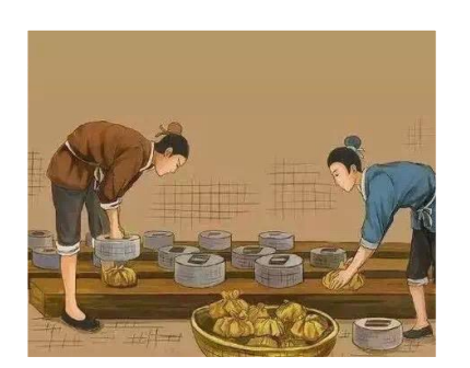
7. Packaging tea cake