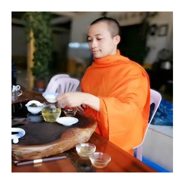
11. The Author making and drinking king tea