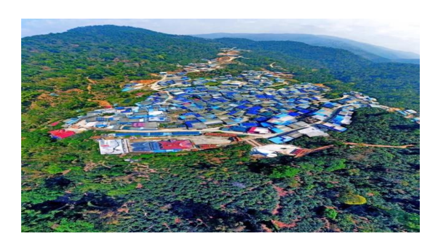
Figure 4 A Landscape Photograph of Laoman'e Village's Sky View Captured by the Author on December 18, 2023

The Bulang ancient and King tea production processing method shows how to make ready-made tea from the beginning to the end, as depicted in the diagram and art images above. The first image depicts farmers pickling tea leaves from tea trees, while the second image shows them scattering the leaves in a storeroom to allow the water to evaporate. The third image illustrates the process of frying tea leaves over a fire using large pans, containing up to 20 kg of tea leaves at a time, before moving on to the fourth stage of production. In the fifth image illustrated how the tea leaves are dried in the sun again after frying. The sixth art image depicts the process of measuring and weighing tea leaves to prepare them for different packing sizes. The seventh image shows how to press the tea leaves together to make tea cake, and the eighth image shows drying tea cake in the sun again. The ninth image shows a ready-made tea cake how looks like, and the tenth image shows a ready-made tea package with the author's name. The eleventh image shows the author making tea and drinking tea at Laoman'e village temple. Ancient and king teas use these processes to create various-sized Bulang King tea cakes, which are then ready for consumption or for sale.