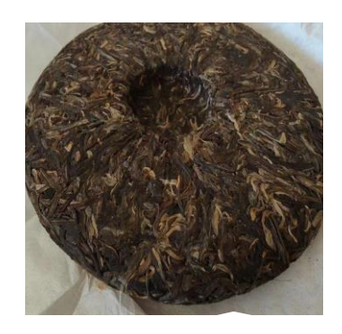
Figure 3 (Continued)