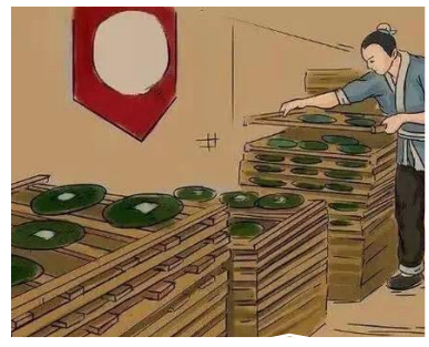
8. Drying king tea cake