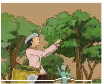
1. Pickling the tea leaves